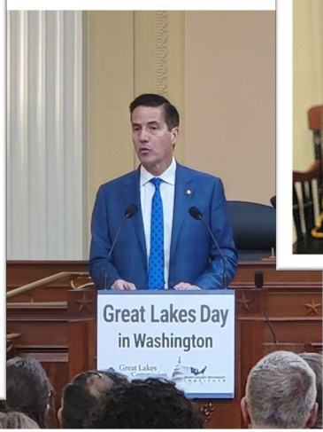
Sen. Bernie Moreno