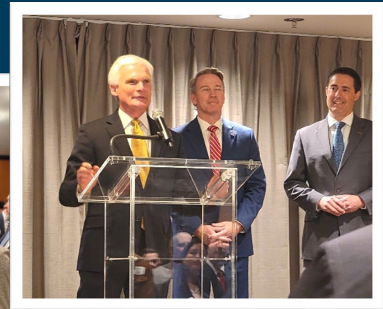
Rep. Bob Latta

Not pictured: Rep. Dave Joyce Rep. Shontel Brown