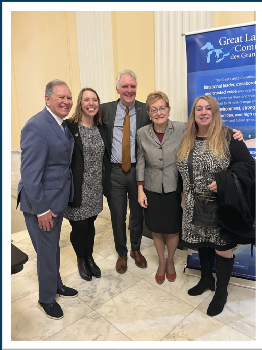
Rep. Marcy Kaptur