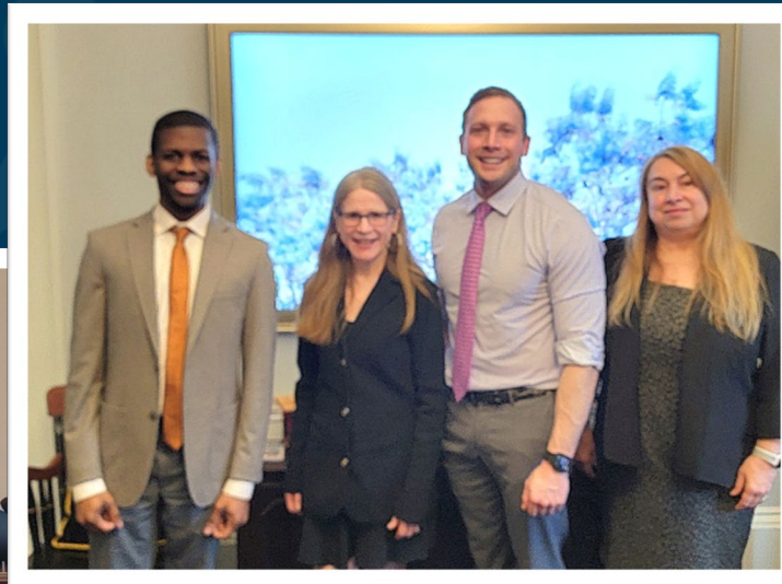
Rep. Max Miller