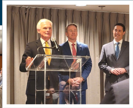
Rep. Bob Latta