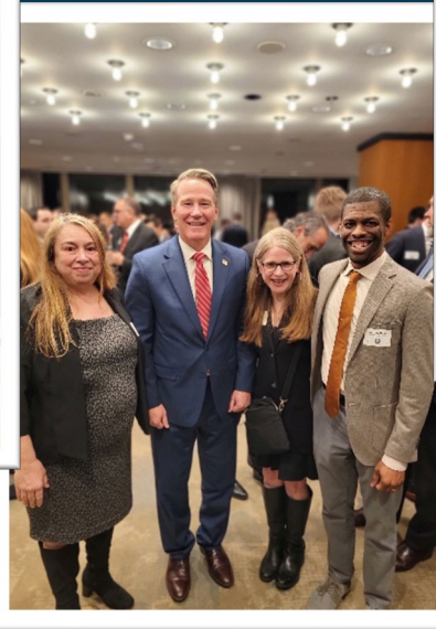
Sen. Jon Husted