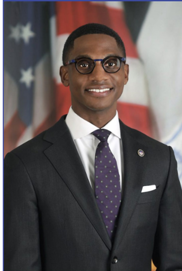
Mayor Justin M. Bibb Cleveland, OH

"As Co-Chair of the National Housing Crisis Task Force, I've seen firsthand Accelerator for America's unique ability to convene and empower local leaders. Whether tackling the housing crisis, advancing infrastructure investment, or strengthening workforce development, AFA helps cities access resources and implement scalable solutions to national challenges. I'm honored to join my peer-Mayors on AFA's Advisory Council as we continue the important work of the Task Force and advance policies that increase economic mobility for all."