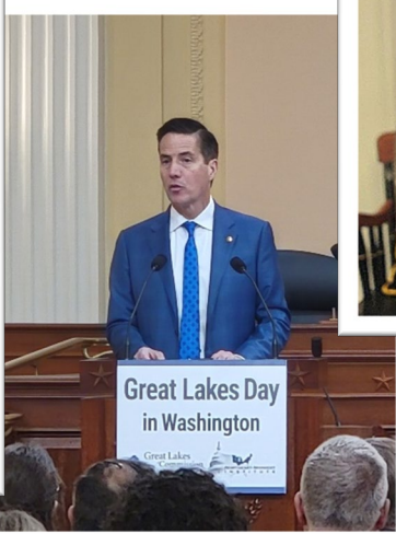
Sen. Bernie Moreno