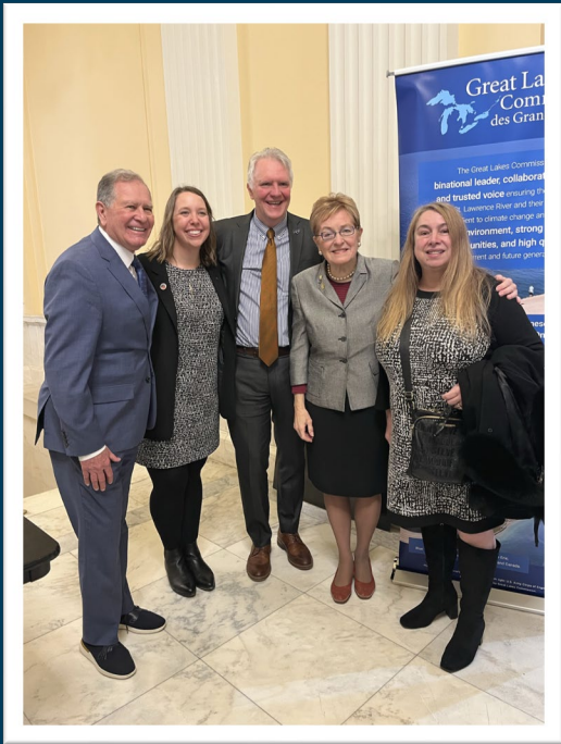
Rep. Marcy Kaptur