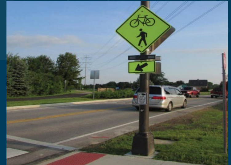
Rectangular Rapid Flashing Beacon (RRFB)

Possible Crash Reduction – 47% Cost: $5,070 - $58,560