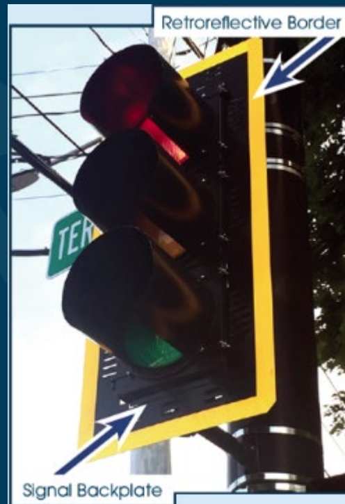
Backplates with Retroreflective Borders

Possible Crash Reduction – 15% Cost: $44 - $150