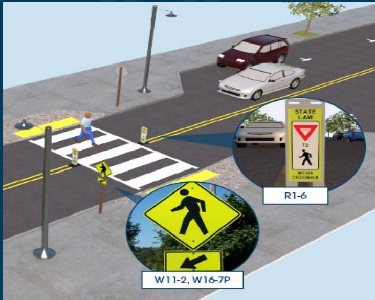
High Visibility Crosswalk Markings (HVCM)

Possible Crash Reduction – 42% Cost: $675 - $6,420