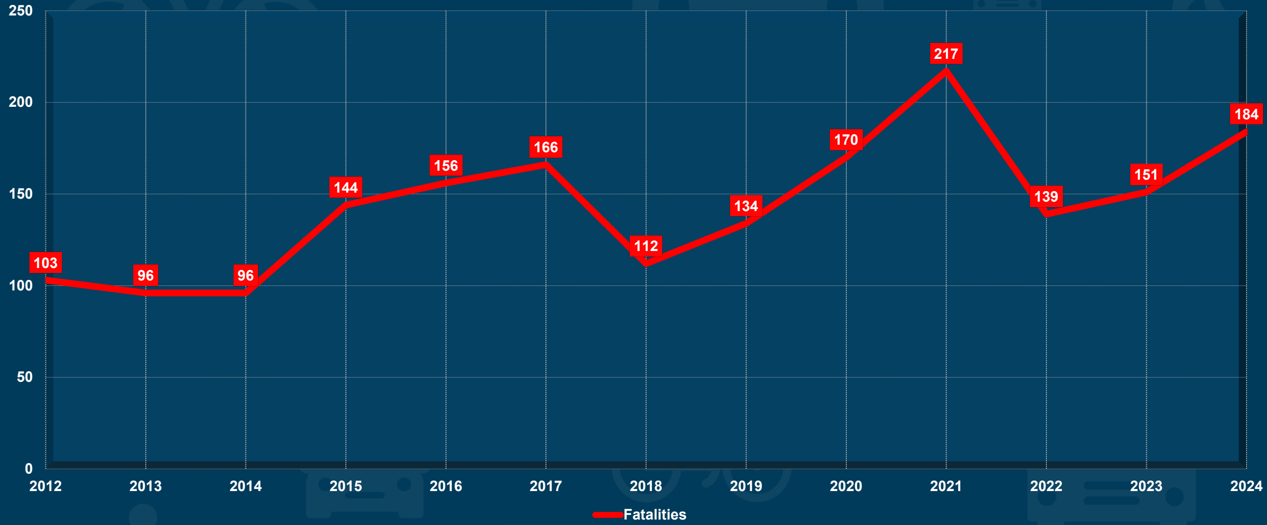
Fatalities per Year