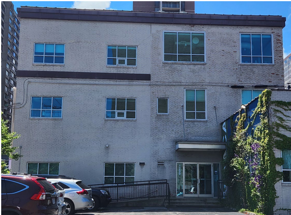
Figure 2: North-facing dominant wall