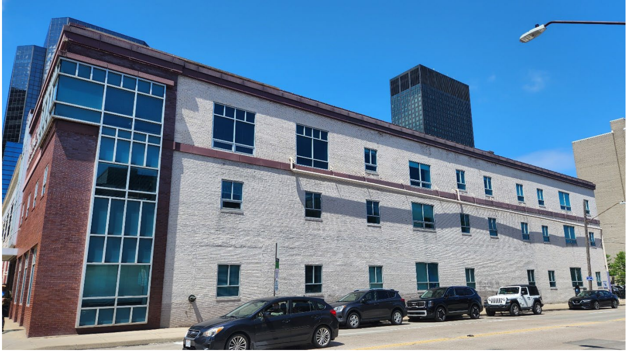
Figure 1: NOACA East-facing wall