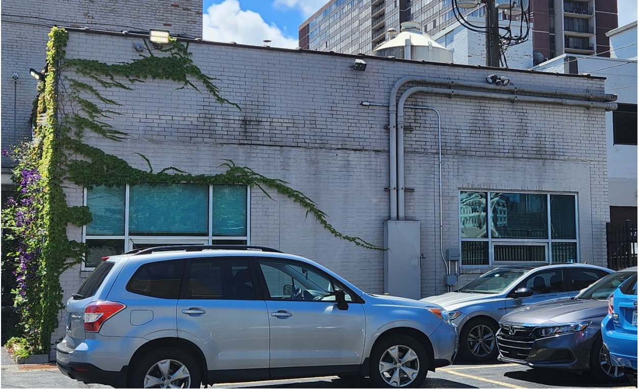
Figure 3: North-facing lower wall