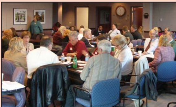
A regional workshop was held in December 2007 to identify and prioritize strategies.