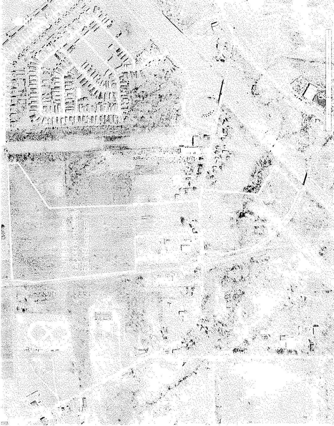
Figure 2 of Exhibit A NOACA Board Resolution 2005-042